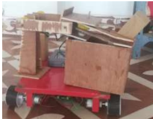
Fig.2. Working model for Automatic trash collector

Figure 2 represents the Working model of our project work. The robot is started to move by tracing the black line using IR sensor. The camera is allowed continuously to take pictures. The dustbin is detected by comparing the image taken by the camera with the default image. If the dustbin is detected the robot stops moving and the robotic arm with the help of gripper picks up the dustbin and transfers the wastes automatically into the container. The process is repeated till the black line ends. Once the black line ends the robot stops moving further.